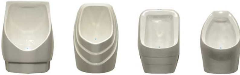
F1000 Vitreous China F2000 Vitreous China F4000 Vitreous China F5000 Vitreous China